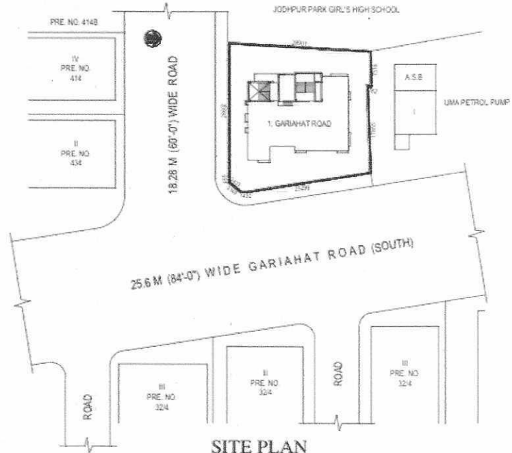
SITE PLAN SCALE = 1:600